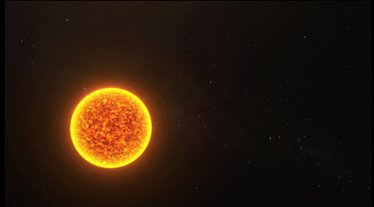
A closeup of a solar eruption, including a solar flare, a coronal mass ejection, and a solar energetic particle event.

Data from NASA’s Kepler mission, pointed to a new idea: energetic particles from our Sun. It turns out that solar energetic particles are a more efficient energy source, and the early Sun was much more active with large space weather events occurring more commonly than today. Results from this work suggest that our active young Sun could have catalyzed the precursors of life more easily and abundantly than lightning. An interesting possibility is that this may have allowed life to form earlier than currently thought.